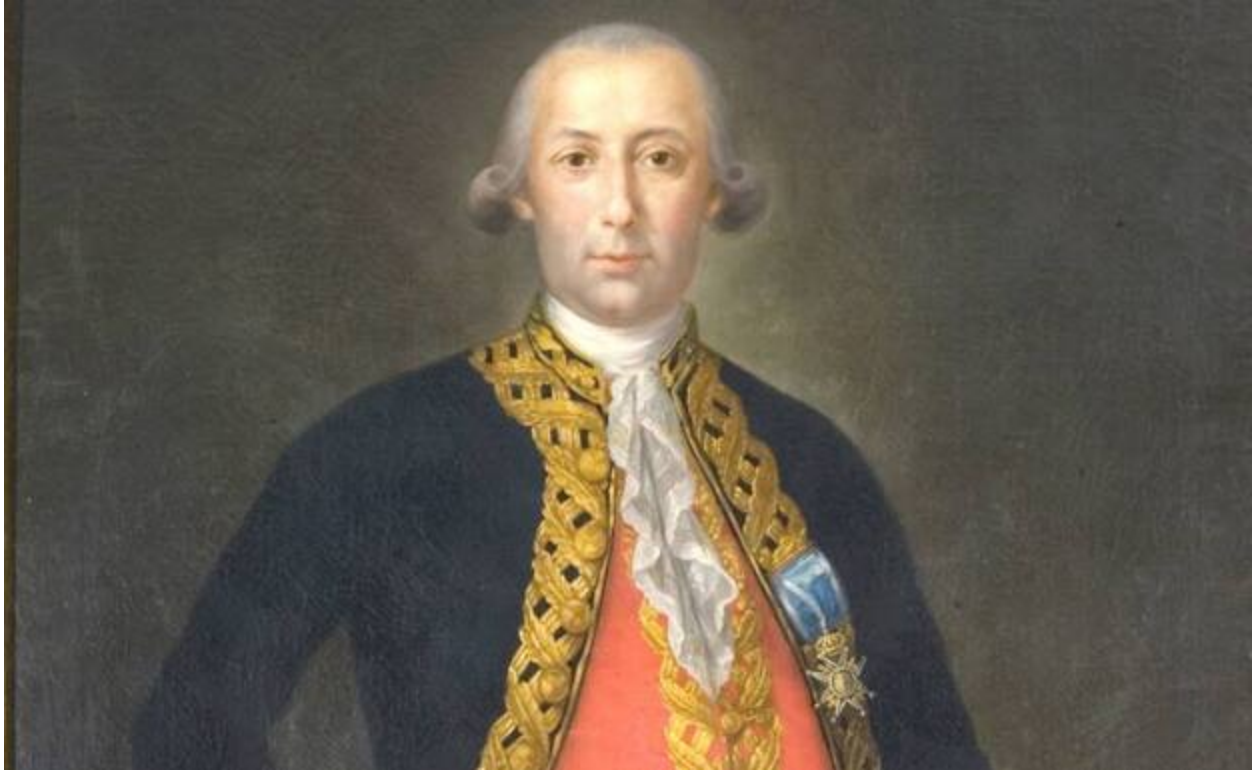
Bernardo de Gálvez, governor of the Spanish colony of Louisiana, present-day United States. SOUTH